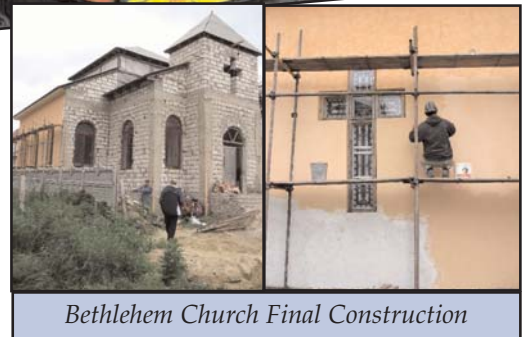
Bethlehem Church Final Construction

This car is very popular in Pecs. It is an old Russian made Trabant that Clista calls a Porky Pig car. The one horse-power version is found only in Eastern Europe.