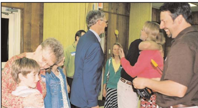
Hugs All Around