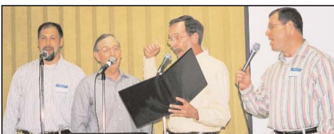
The Spirited Emmanuel Quartet