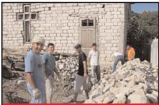
Work at Vulcanesti Church