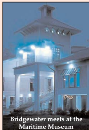
Bridgewater meets at the Maritime Museum