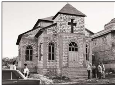
Members of Bethlehem Church in front of their soon to be completed building.

After 5 years of valiant struggle, Bethlehem Baptist Church in Vulacanesti, Moldova, a Gypsy congregation, will soon have a building for the first time in partnership with CBF-LA.