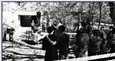
Bethlehem Church worshipping outside.

Living in a cold climate, villagers have none of the amenities we expect. "Central heating" consists of a stove in the middle of the dwelling where the smoke is channeled through winding passages before finally exiting the house, thus heating not only the room with the stove but also the room on the backside of the stove, and is actually very efficient.