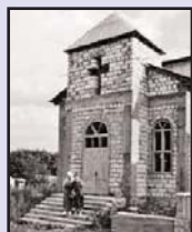
Bethlehem Baptist Church, Vulcanesti, Moldova

We are bringing our loaves and fishes to help a small impoverished Gypsy congregation that has struggled mightily for 5 years to refurbish a building up to code, so they can be allowed a place for worship and ministry outreach in their village.