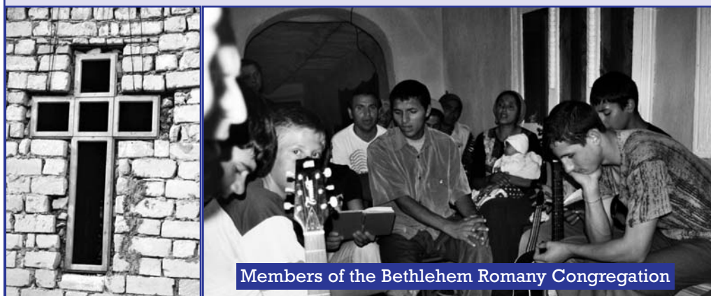
Members of the Bethlehem Romany Congregation