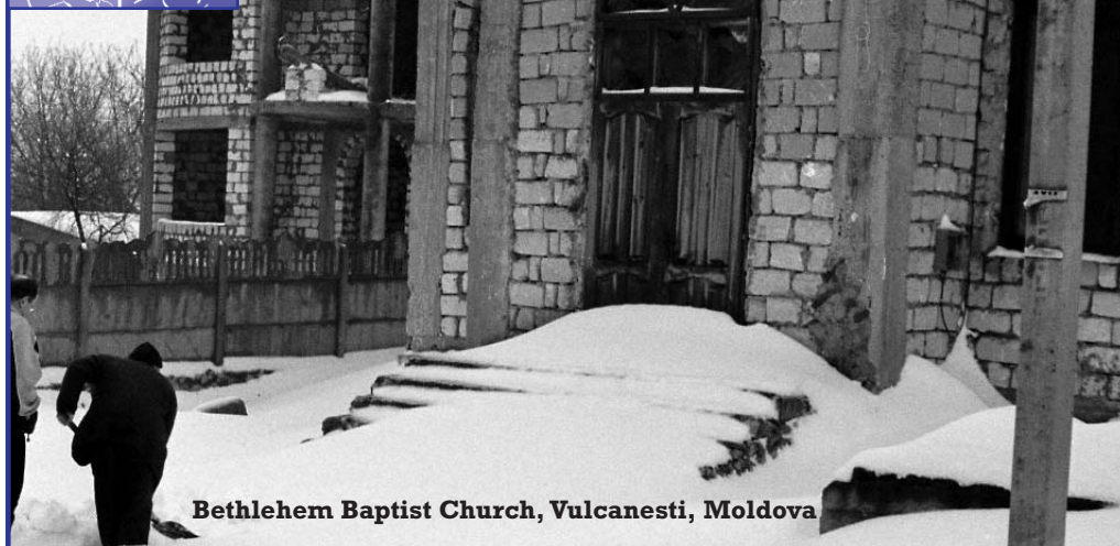
Bethlehem Baptist Church, Vulcanesti, Moldova

Partners in Prayer Calendar Some missionary names omitted due to sensitive nature of work.