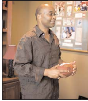
Hill started a football program to encourage male applications — but holds to the mantra: "No Books, No Ball."