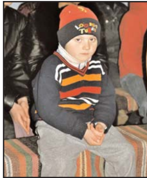
Romany Mission News Full updates at cbfla.org