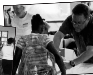
Together for Hope