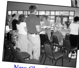
New Church Start

WHETHER GIVING AID IN TIME OF DISASTER, SHARING HOPE IN A LAND OF POVERTY, OR OFFERING SPIRITUAL HARBOR IN A NEW FAITH COMMUNITY -- PLACES OF GRACE HAVE BEEN BORN AS RESULT OF CBF-LA MINISTRIES.